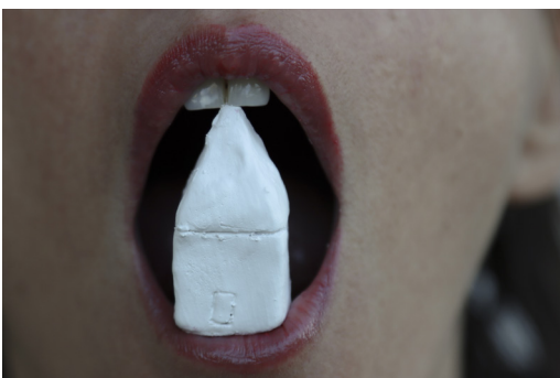
THE WORLD IN MY MOUTH (HOUSE)

Digital color, photography couleur inkjet printed on Epson Baryta paper, glued on 1mm aluminium, oak floater frame, 10 x 15 cm (without frame), 14 x 19 cm (with frame), edition of 3 + 2 AP