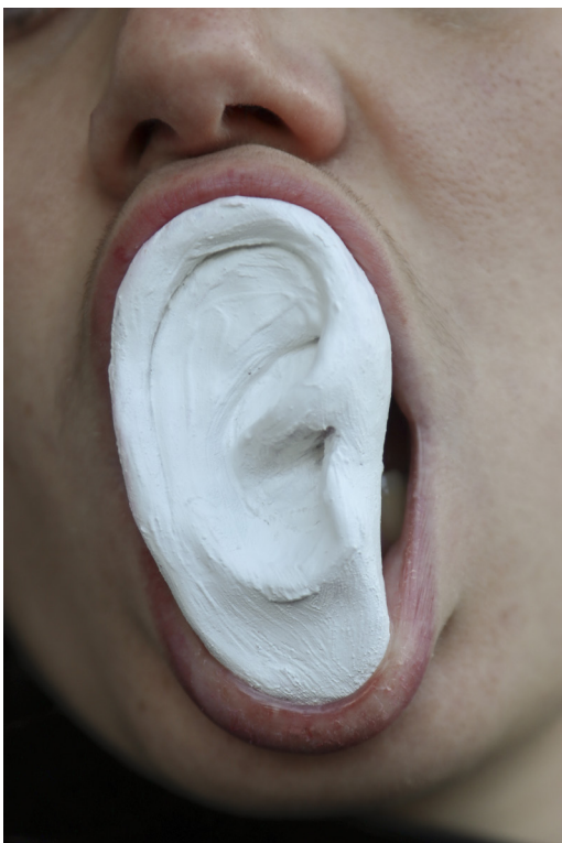
THE WORLD IN MY MOUTH (EAR)

Digital color, photography couleur inkjet printed on Epson Baryta paper, glued on 1mm aluminium, oak floater frame, 15 x 10 cm (without frame), 19 x 14 cm (with frame), edition of 3 + 2 AP