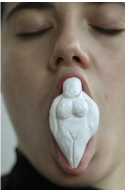
THE WORLD IN MY MOUTH (VENUS)

Digital color, photography couleur inkjet printed on Epson Baryta paper, glued on 1mm aluminium, oak floater frame, 15 x 10 cm (without frame), 19 x 14 cm (with frame), edition of 3 + 2 AP