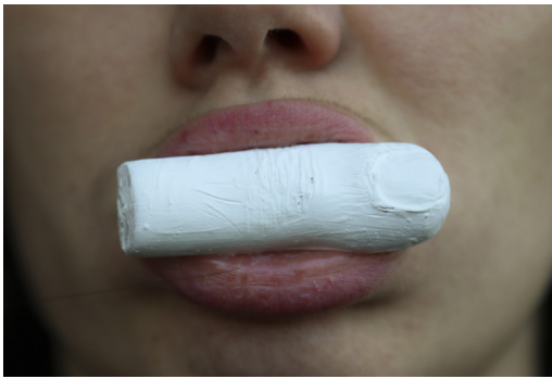
THE WORLD IN MY MOUTH (FINGER)

Sculpture, recycled leather beige color, fabric, 105 x 60 x 15 cm around, unique piece