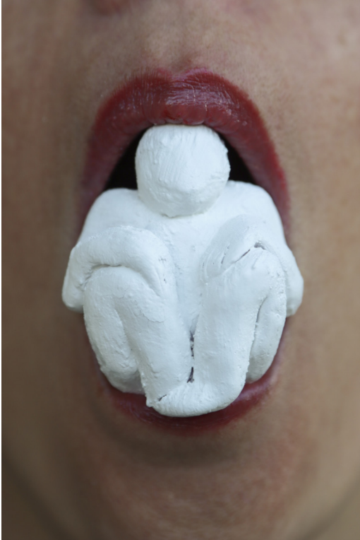
THE WORLD IN MY MOUTH (CROUCHING CARYATID)