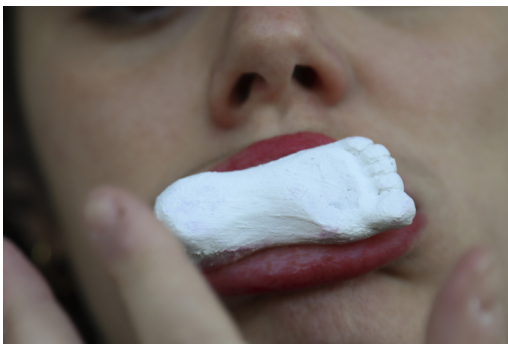
THE WORLD IN MY MOUTH (FOOT)

Digital color, photography couleur inkjet printed on Epson Baryta paper, glued on 1mm aluminium, oak floater frame, 10 x 15 cm (without frame), 14 x 19 cm (with frame), edition of 3 + 2 AP