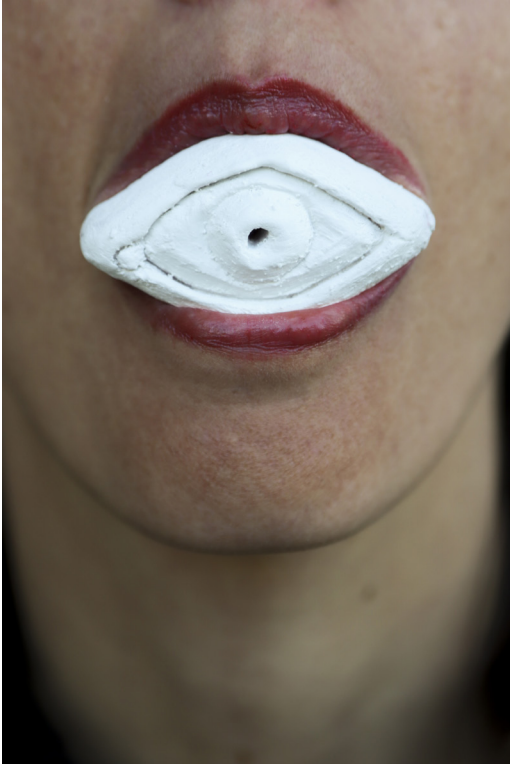
THE WORLD IN MY MOUTH (EYE)